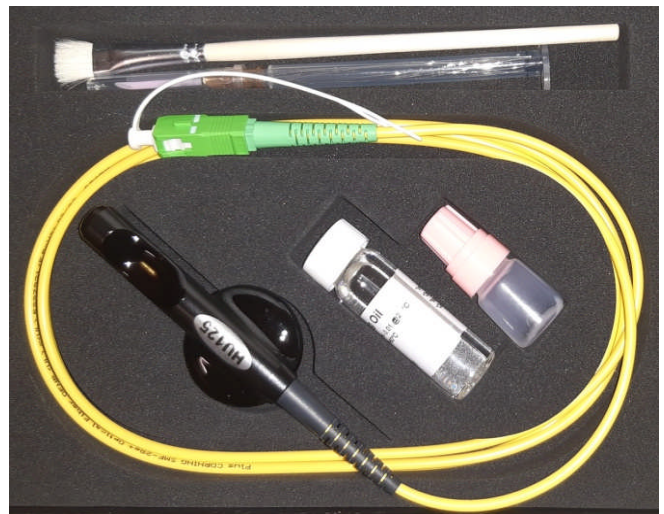
The above photo shows an SM unit with SC/APC connector

SPECIFICATIONS: Fiber Diameter: 125 +/-2 \mu\text{m} Insertion Loss: typically < 0.3dB Alignment Time: approx. 1 sec Number of Insertions: > 10,000 Reflection Loss: typically > 50dB Operating Temperature Range: -10°C to 50°C. Bare Fiber Ends do not need special cutting tools - the fiber can be broken by hand or cut with scissors, although specialist fiber cutters give lowest insertion losses (refer to picture for examples). HU-125-SM with FC/UPC or SC/APC with approx. 1.4 meters of cable are the standard singlemode units (9/125 \mu\text{m} fiber). Singlemode connector options include FC and SC, with either UPC or APC. HU-125-MM (multimode unit) is available with 62.5/125 \mu\text{m} or 50/125 \mu\text{m} graded index (GI) fiber and has approx. 1.4 metres of cable. Multimode connector options include FC/PC and ST/PC. A cable length of approx. 3 meters is optionally available for all singlemode and multimode units. An HU/125/80 option incorporates a cable with 80 \mu\text{m} diameter fiber for measurements on 80 \mu\text{m} bare fibers. The HU-125 comes with index matching oil, cleaning brush, needle, cleaning wires, and manual.